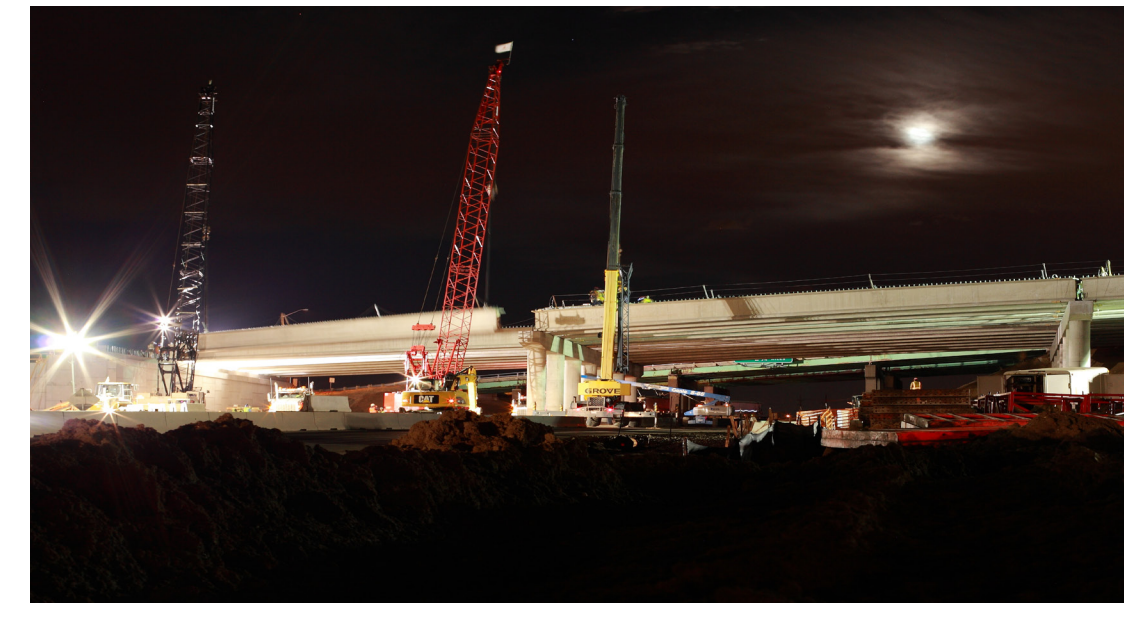
Wadsworth Parkway Bridge Girder Installation